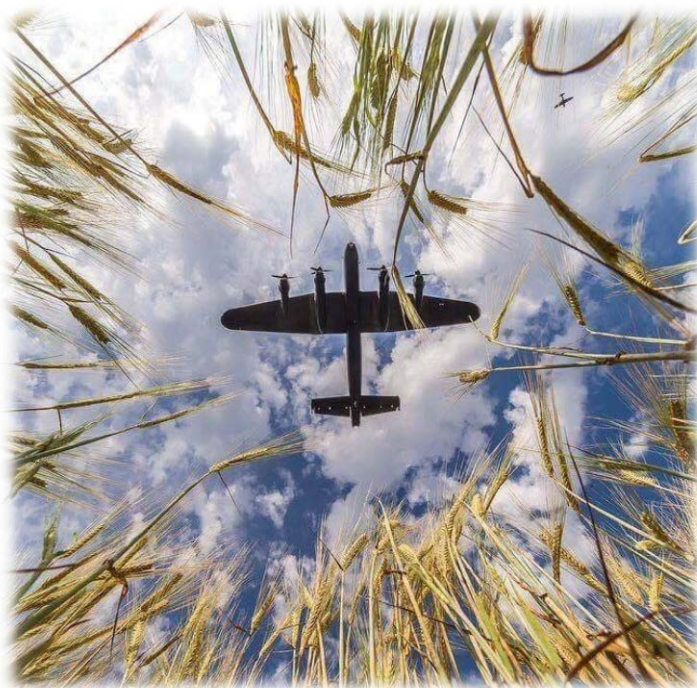
To come at this year's fete 2017 (subject to weather)